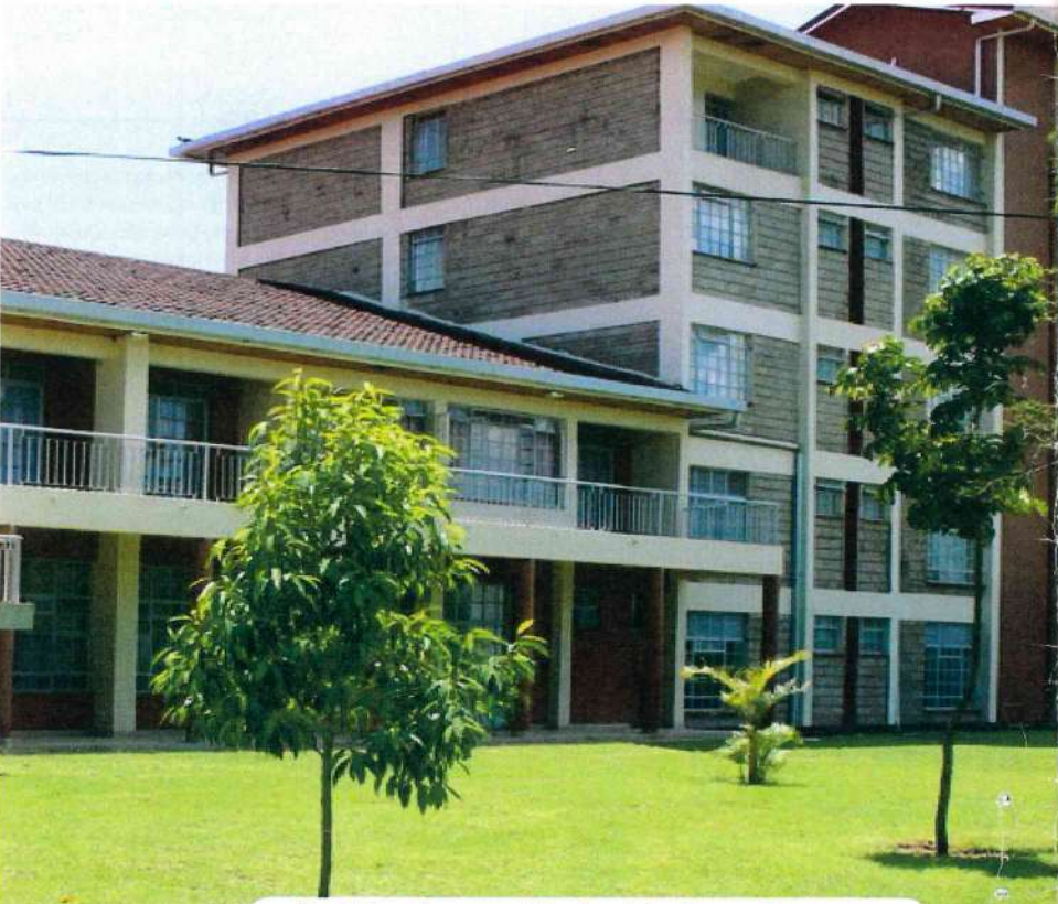
Machakos University Hotel and Conference Centre