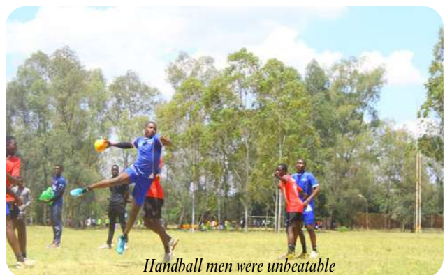
Handball men were unbeatable

Both Men and Women recorded strong wins, proving teamwork and determination