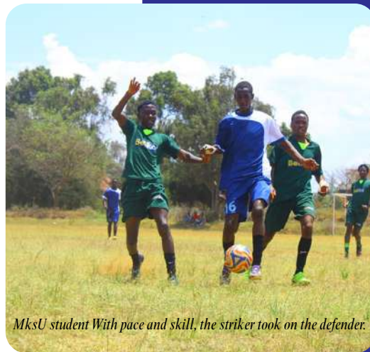
MksU student With pace and skill, the striker took on the defender.

Narrow 1–0 defeats for both Men and Ladies, with the men’s game clouded by a controversial ‘goal’