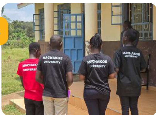
Go Green Club Students from Machakos University

The initiative is a clear reflection of Machakos University's commitment to creating a lasting impact beyond its lecture halls. By promoting STEM (Science, Technology, Engineering, and Mathematics) education and addressing basic welfare needs, the university is actively uplifting communities nationwide.