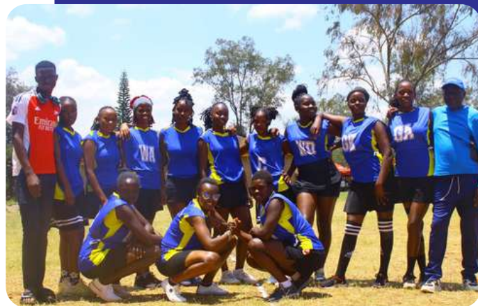
Ladies Netball Team

Our Ladies crushed MMU 46–10 in a dominant show.