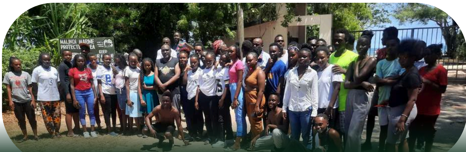
MksU Environmental Club and Environmental Science students during an educational visit to Malindi Marine National Park

Student leadership and hands-on learning are actively promoted through the Machakos University Environmental Club, which drives impactful activities such as tree planting, clean-ups, climate action forums, and community outreach. Field excursions and academic trips further enrich learning by exposing students to real-world environmental projects, industries, and communities.