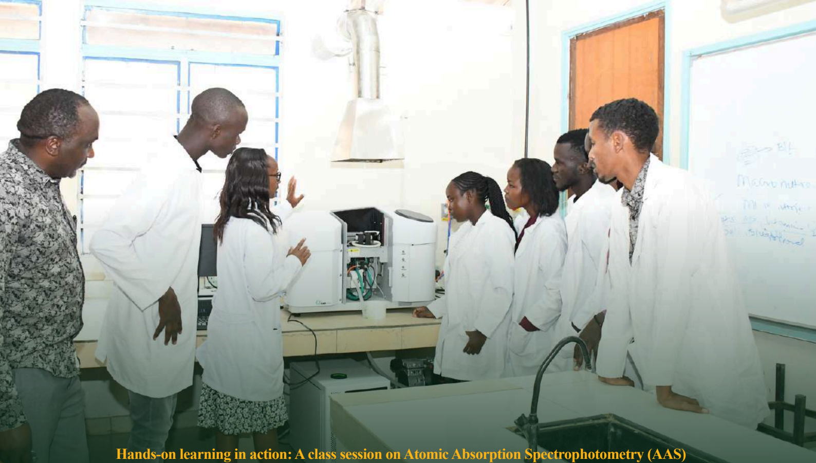
Hands-on learning in action: A class session on Atomic Absorption Spectrophotometry (AAS)

Student leadership and hands-on learning are actively promoted through the Machakos University Environmental Club, which drives impactful activities such as tree planting, clean-ups, climate action forums, and community outreach. Field excursions and academic trips further enrich learning by exposing students to real-world environmental projects, industries, and communities.