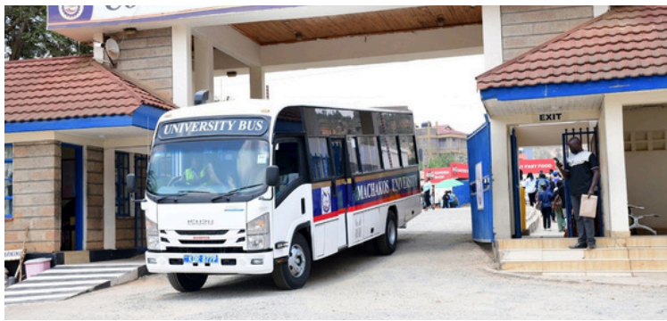
The New University Bus

This new addition underscores the University's commitment to providing efficient, safe, and reliable transport services to its fast-growing community. It will support academic, co-curricular, and administrative activities, ensuring smooth mobility for students and staff alike.