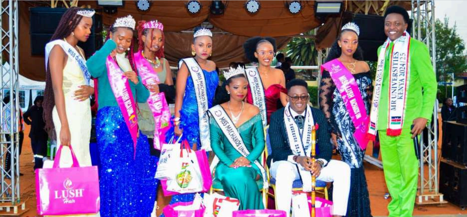
Group photo of the winners