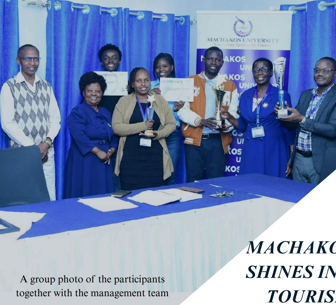
A group photo of the participants together with the management team