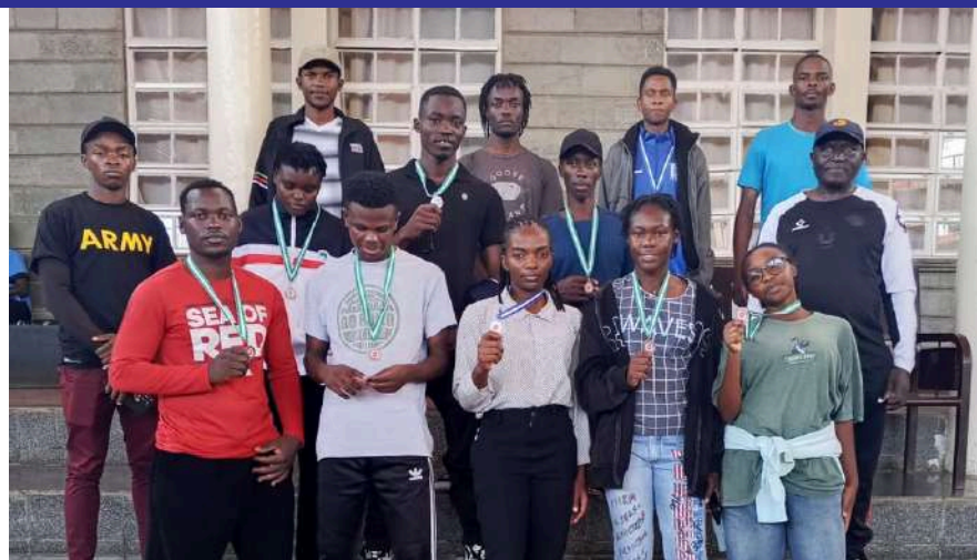
Medal moments! 🏆🥇🥈🥉 The MksU Karate Team showcasing their hard-earned medals at Kabarak University.

It's been a thrilling week for Machakos University sportsmen and women, filled with medals, dominant victories, and a busy schedule of upcoming fixtures. From the national stage to local friendlies, the Warriors are flying the flag high!