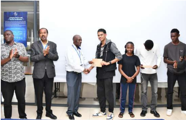
DVC ASA presenting an award During the closing ceremony