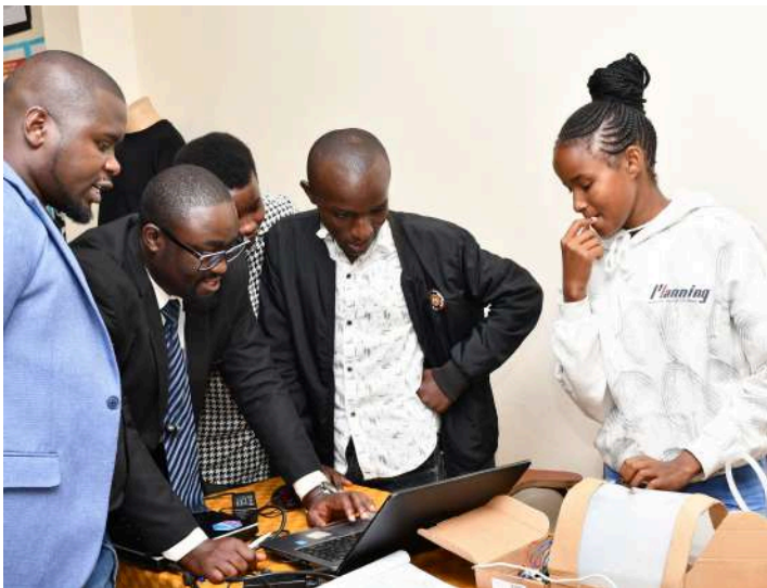
The adjudicators inspecting one of the projects

Creativity and ingenuity were on full display during the 8th Innovation and Exhibition Week held from 12th to 13th March 2026, bringing together students, staff, and external exhibitors in a vibrant showcase of groundbreaking ideas and transformative solutions.