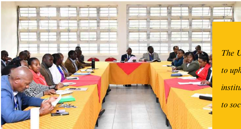
Auditors and Process Owners during the opening meeting

The University remains committed to upholding the highest standards of institutional excellence and service to society.