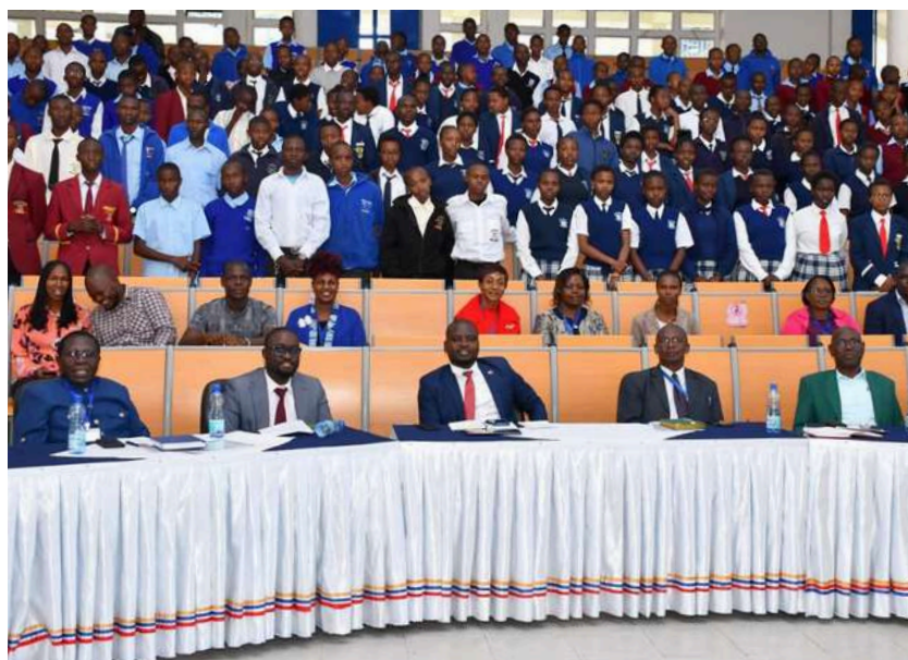
Senior University management with invited guests during the opening of the 8th Innovation week