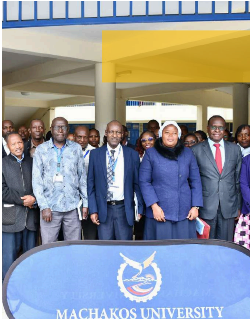
The Auditing Team posing for a group photo before proceeding for the audit exercise.

Through regular audit exercises, Machakos University continues to foster a culture of integrity, responsibility, and continuous improvement in the delivery of its core mandate of teaching, research, and community engagement.