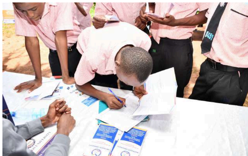
Machakos University team interacts with students from St. Martins High School, Kathonzweni, during a career expo.

Machakos University remains committed to empowering learners through continuous outreach, career guidance, and accessible pathways to quality higher education.