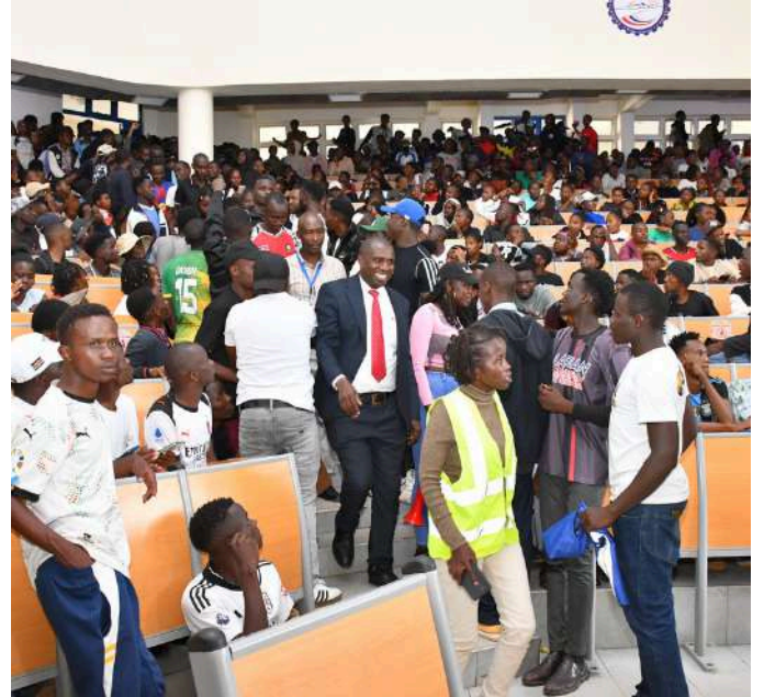
Machakos University students gather for the 2026/2027 SAMU Elections at the Amphitheatre