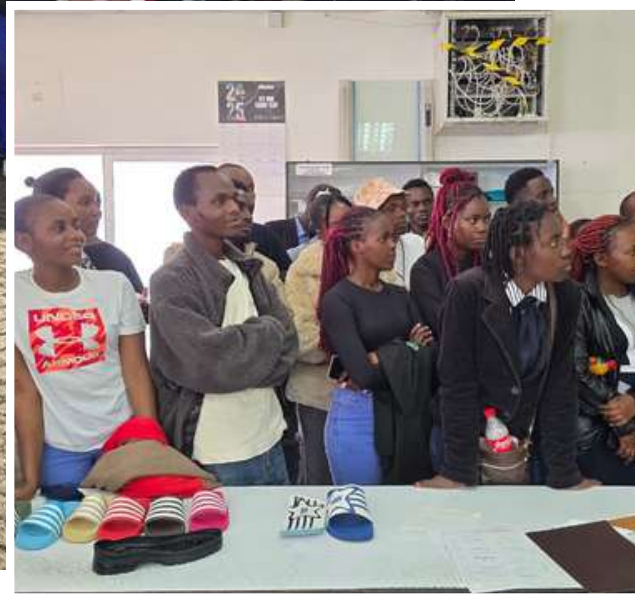
Bachelor of Commerce Fourth-year students, during an academic trip to the Bata Shoe Company in Limuru, Kiambu County.

Fourth-year students from the School of Business, Economic, Hospitality and Tourism management undertook an academic trip to Bata Shoe Company in Limuru on 12th March 2025. During the visit, Bata managers engaged students through interactive sessions and career talks, offering insights into the corporate environment and industry expectations. Students interacted with professionals across key departments including Marketing, Accounting, Finance, Human Resource Management, Procurement, and Production.