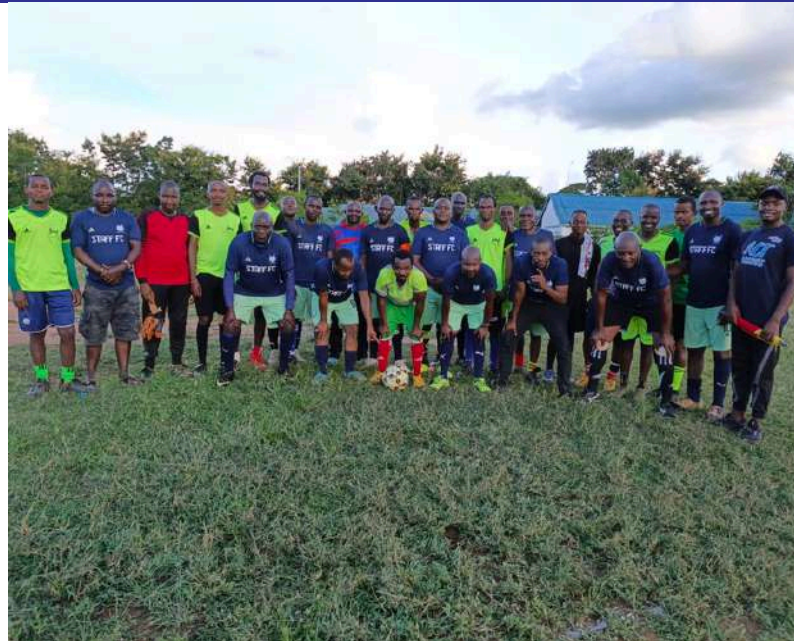
MksU Staff FC team engages in a post-match bonding session following a 4-4 draw.