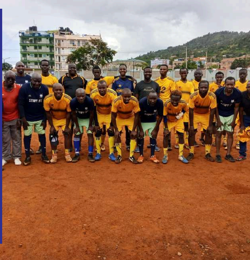
MksU Staff FC blending with Kenya Pipeline Staff FC after their friendly match on 12th March 2026 at MksU sports ground.

It was a thrilling match packed with lots of entertainment from the mature legends of both teams. Enthusiasts, fans and spectators were thoroughly entertained. The game ended at a 4:4 score line draw.