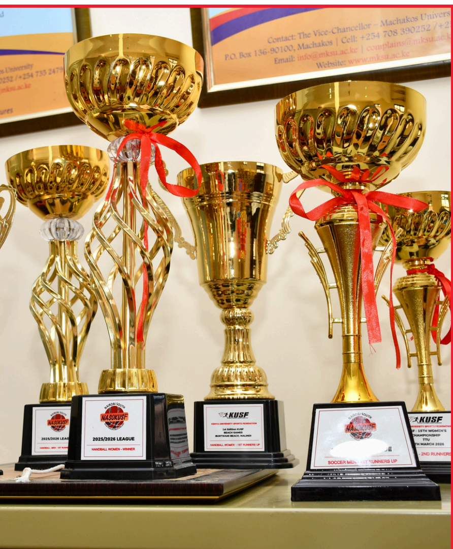
Trophies won by MksU during the 2025/2026 season

2. A collaboration between Kenya University Sports Federation(KUSF) and Kenya Sports shooting Federation(KSSF) held a superb training in air pistol and air rifle at the Kenya Regiment Rifle club, Lang'ata-Nairobi on 18 th April 2026. Close to 50 University students from NaSoKUSF conference attended with MksU represented by 2 Students.