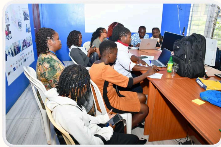
KUCCPS Officials assisting parents and prospective students at Machakos University

Stakeholders and members of the public are encouraged to take advantage of this initiative to help disseminate this information widely to boost awareness and increase application uptake among eligible candidates.