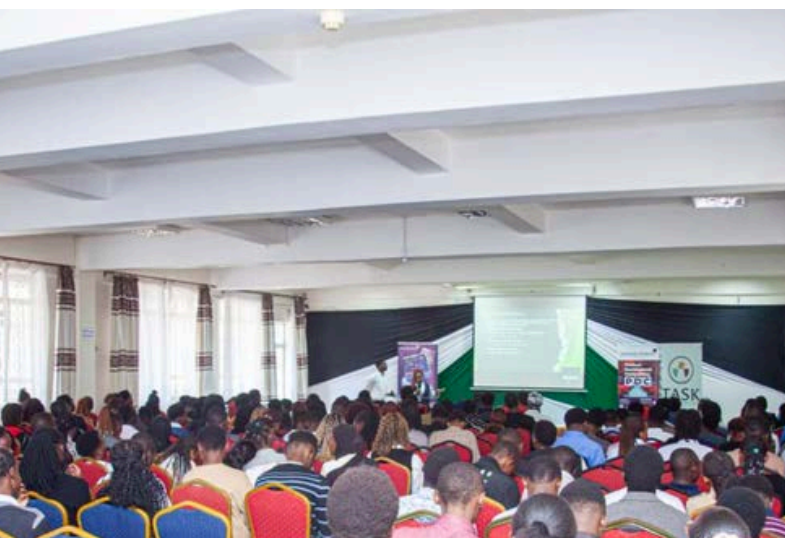
Participants during the PDC forum

The department organizes field excursions and industry trips to enrich learning and expose students to real-world environments, ensuring graduates are well-prepared for professional challenges.