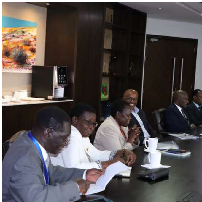
The Vice-Chancellor with members of the Management during a courtesy visit to the university Chancellor