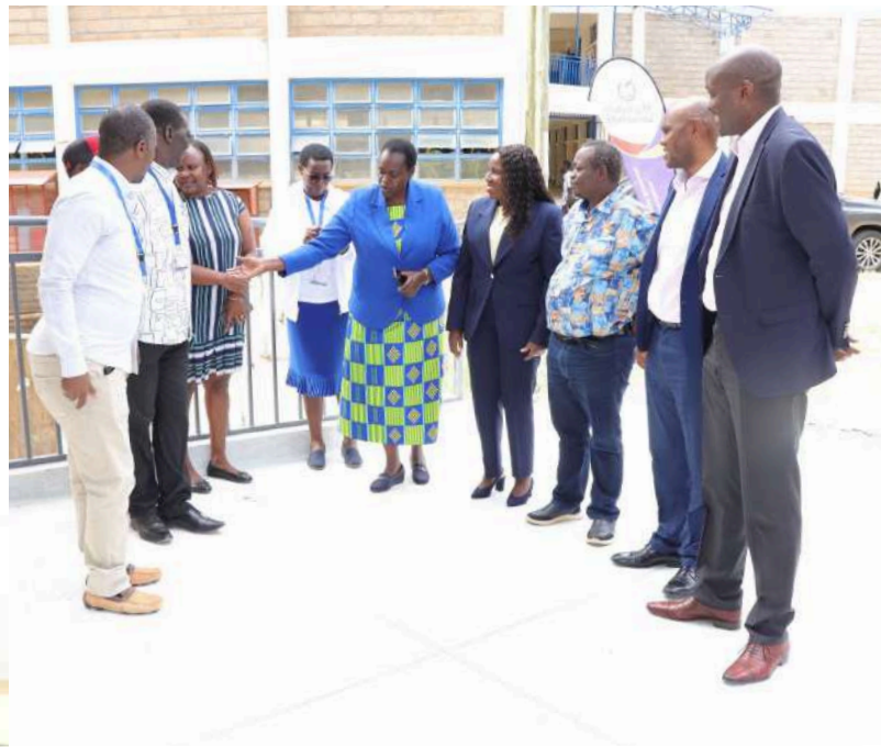
The PS and team, with the VC and members of the Management during a group photo