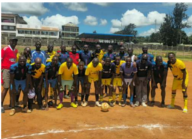
MksU staff FC pose for a photo before kickoff

The fixtures provided valuable match fitness and exposure to different styles of play, while also strengthening connections with alumni players across teams. The team continues to build momentum ahead of the University Staff Games.