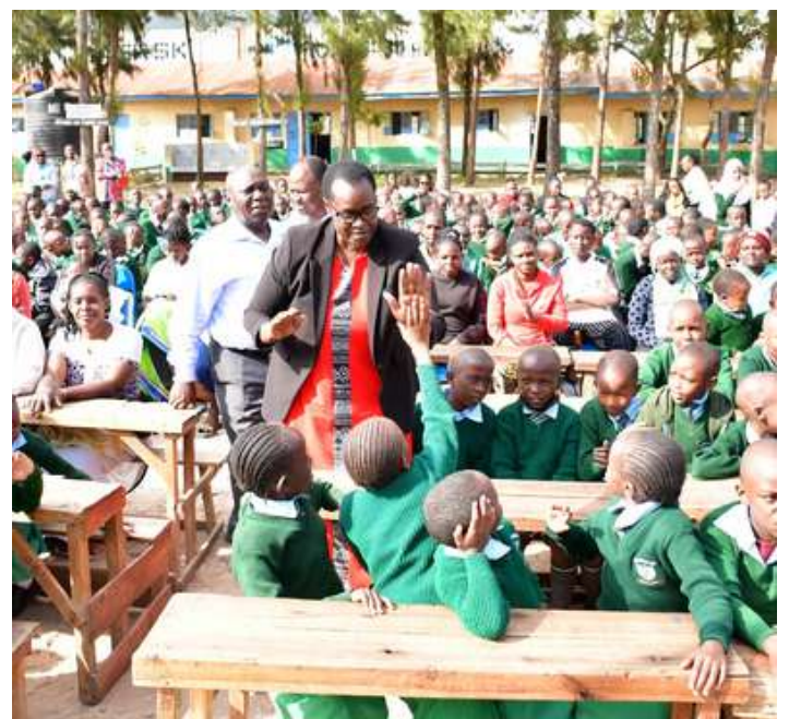
The Vice Chancellor, interacting with the young learners