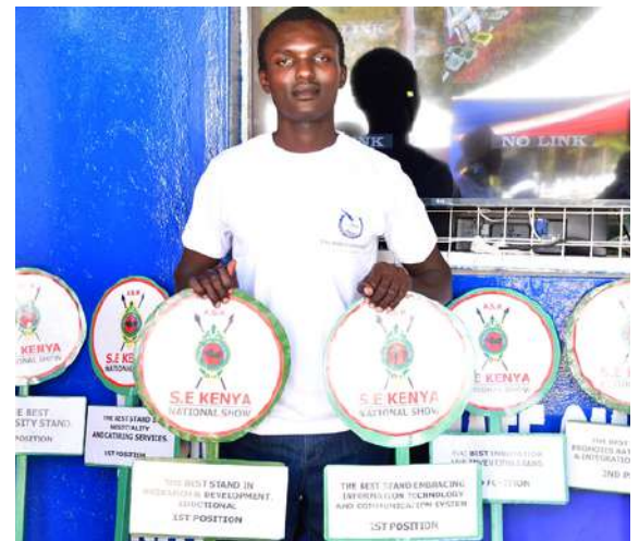
MksU student displaying the awards

Machakos University achieved outstanding success at the exhibition, earning four 1st-place awards, three 2nd-place awards, and three 3rd-place awards across key categories, including Best University Stand, Research and Development Education, Hospitality and Catering Services, and ICT Integration.