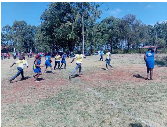
The Machakos University Ladies Staff Team in action during the match