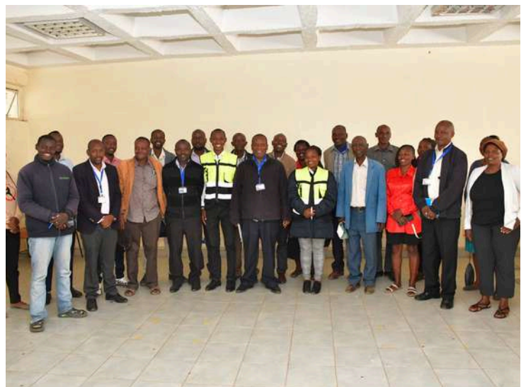
Participants group photo

The exercise reaffirmed the University's commitment to sustainable development, innovation, and inclusive decision-making. Once completed, the Smart TVET Building is expected to strengthen practical training, support skills development, and provide modern learning spaces that align with the evolving demands of industry and the workforce.