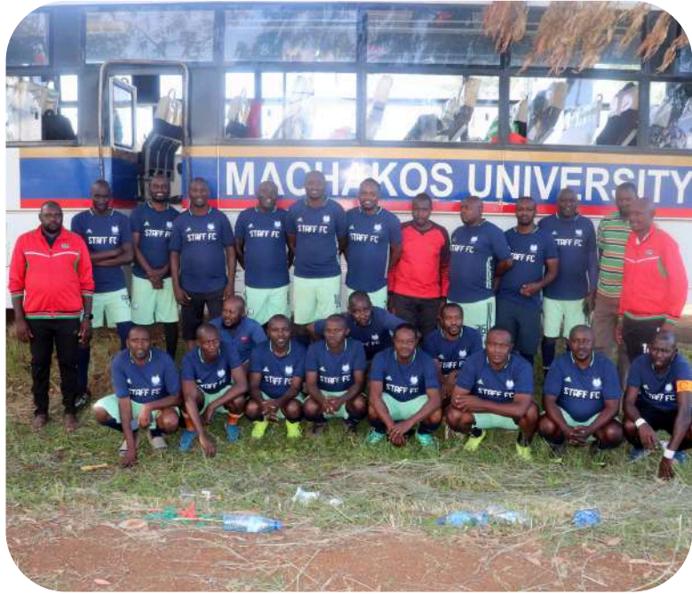
MksU staff team (male)

The students' football team emerged champions at the Machakos Agricultural Society of Kenya (ASK) Show Football Tournament held from 3rd to 5th June 2026. The team displayed exceptional skill, teamwork, and determination throughout the competition, advancing to the finals before defeating Jua Kali FC to lift the championship trophy. The victory marked a significant achievement and reflected the team's hard work and commitment.