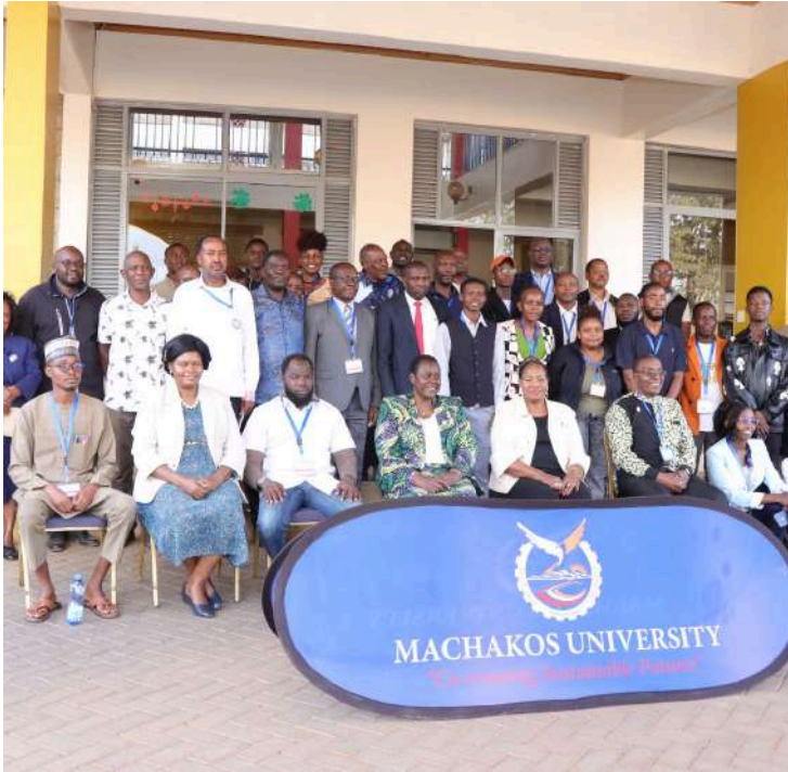
Participants pose for a group photo during the Machakos 7th International Conference closing ceremony

Machakos University successfully hosted its 7th International Conference on 18th–19th June 2026 under the theme, “Leveraging the 5th Industrial Revolution in Research and Technology for Sustainable Development.” The two-day event brought together scholars, researchers, innovators, policymakers, industry leaders, students, and development partners from Kenya and across the globe to explore the transformative role of research, innovation, and technology in advancing sustainable development.