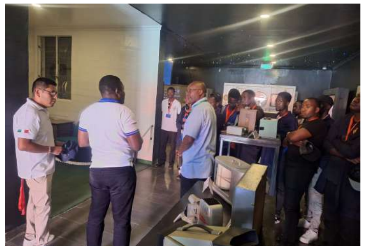
Diploma in Electrical Engineering students from Machakos University during an educational field trip to Malindi, gaining practical industry exposure.

The excursion offered an enriching learning experience that bridged the gap between theory and practice while exposing students to emerging opportunities in engineering, technology, and space science. Beyond enhancing their technical knowledge, the visit inspired students to envision broader career possibilities and appreciate the role of innovation in shaping the future of engineering.