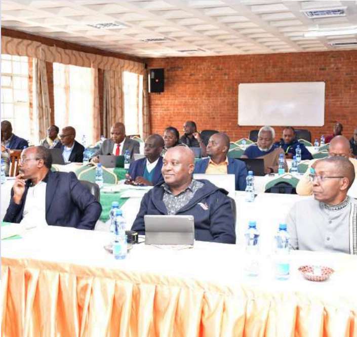
Participants during the Dissemination Workshop of CUE Research Outputs at the Machakos University Hotel & Conference Center

Machakos University hosted a high-level Research Dissemination Workshop organized by the Commission for University Education (CUE), bringing together senior officials from the Ministry of Education, CUE, and universities across Kenya to deliberate on university performance, enrolment trends, and graduate employability.