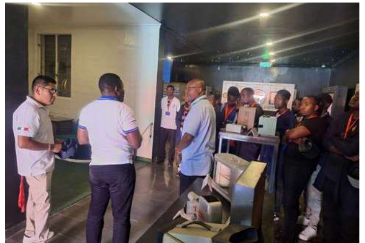
Diploma in Electrical Engineering students from Machakos University during an educational field trip to Malindi, gaining practical industry exposure.

The excursion offered an enriching learning experience that bridged the gap between theory and practice while exposing students to emerging opportunities in engineering, technology, and space science. Beyond enhancing their technical knowledge, the visit inspired students to envision broader career possibilities and appreciate the role of innovation in shaping the future of engineering.