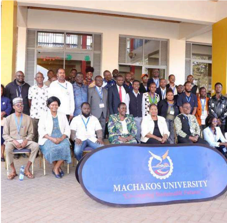
Participants pose for a group photo during the Machakos 7th International Conference closing ceremony

Machakos University successfully hosted its 7th International Conference on 18th–19th June 2026 under the theme, “Leveraging the 5th Industrial Revolution in Research and Technology for Sustainable Development.” The two-day event brought together scholars, researchers, innovators, policymakers, industry leaders, students, and development partners from Kenya and across the globe to explore the transformative role of research, innovation, and technology in advancing sustainable development.