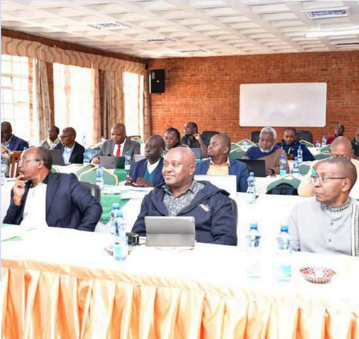
Participants during the Dissemination Workshop of CUE Research Outputs at the Machakos University Hotel & Conference Center

Machakos University hosted a high-level Research Dissemination Workshop organized by the Commission for University Education (CUE), bringing together senior officials from the Ministry of Education, CUE, and universities across Kenya to deliberate on university performance, enrolment trends, and graduate employability.