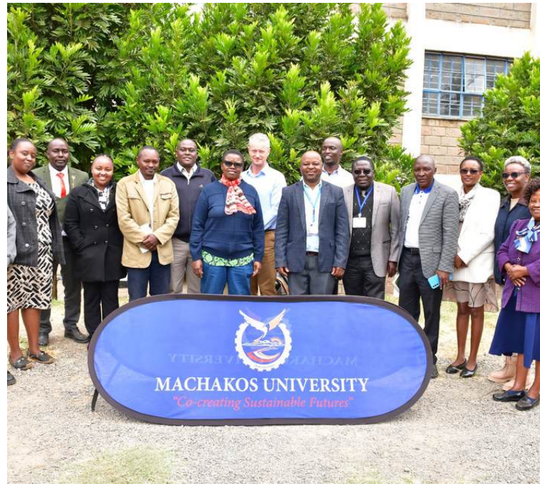
Representatives from Machakos University, SCOPE Kenya, AFSA, and IDRC Canada following the consultative meeting