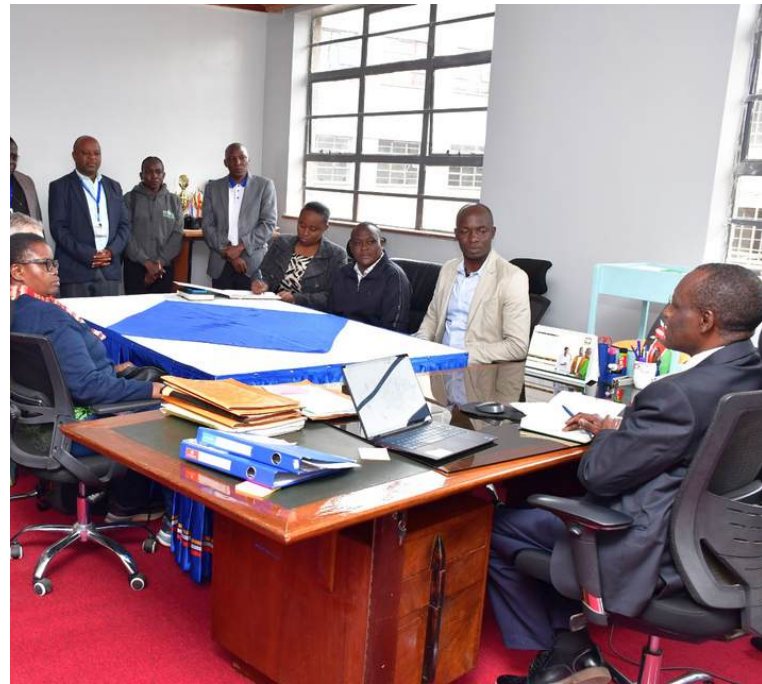
A courtesy visit by the SCOPE Kenya delegation

Machakos University, in collaboration with SCOPE Kenya, Agroecology and Food Sovereignty Across Africa (AFSA), and the International Development Research Centre (IDRC), Canada, conducted a monitoring and evaluation visit to Kimua Comprehensive School on 1st July, 2026 to assess the progress and impact of the School Feeding Pilot Programme.