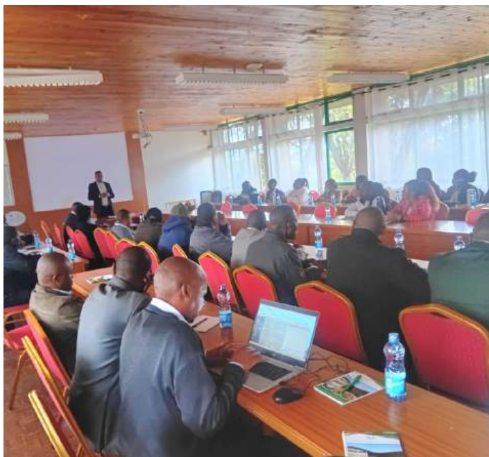
MksU ISO Champions during the two-day ISO Quality Management System (QMS) Champions Training

The training reflects Machakos University's unwavering commitment to embedding quality in every aspect of its operations. By empowering ISO Champions, the University continues to strengthen its Quality Management System and advance its mission of delivering excellence in teaching, research, innovation, and community service.