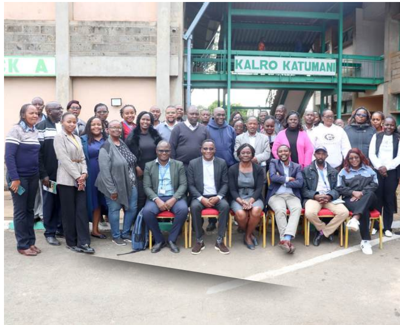
Machakos University ISO Champions at KALRO in Machakos