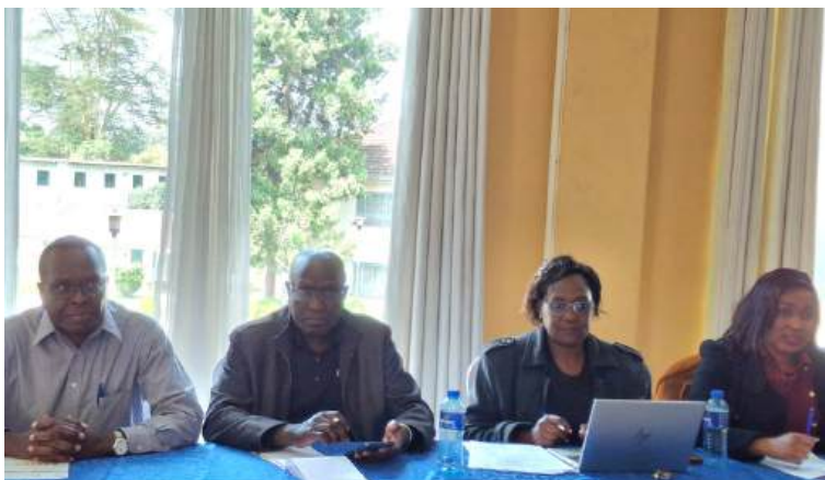
Members of the Productivity Mainstreaming Committee during the training

Machakos University's Productivity Mainstreaming Committee successfully participated in a two-day training on Productivity Mainstreaming and Productivity Index Computation at the Kenya Institute of Curriculum Development (KICD), Nairobi. The training equipped participants with the knowledge, skills, and practical tools required to enhance institutional efficiency, strengthen service delivery, and align the University with the Government's new productivity framework, under which productivity will form a key component of Performance Contracting. The programme also provided valuable insights into productivity measurement and continuous improvement strategies, reinforcing the University's commitment to operational excellence and quality service delivery. Machakos University's provisional Productivity Index indicates encouraging progress, reflecting ongoing efforts to foster a culture of efficiency, accountability, and continuous improvement across the institution.